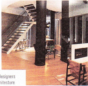
HOT SHOTS Designers from MR Architecture + Décor show the possibilities of a pad at One Jackson Square.